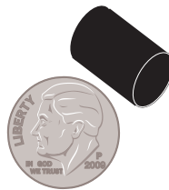
Uranium Fuel Pellet (actual size)