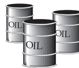
3 Barrels of Oil (42 gal. each)